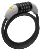
Combination Cable Lock